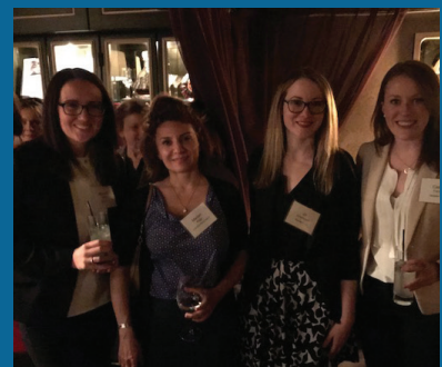
Vedder Price hosted its 4th Annual Women in Transportation Finance Reception on May 10th. More than 50 women leaders in the transportation finance industry attended this highly anticipated annual networking event held in New York City.