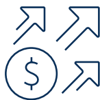
Private equity funds