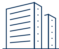
Real asset and real estate funds