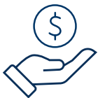
Venture Capital funds